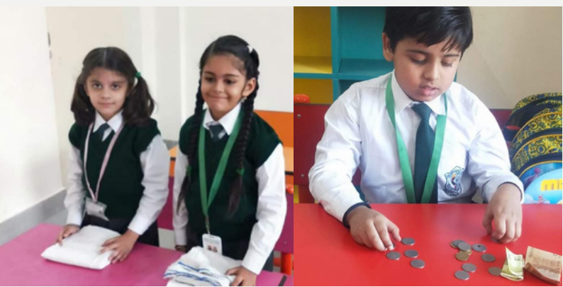
FOLDING CLOTHES ACTIVITY