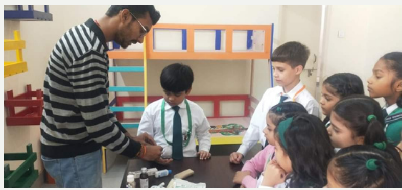
FIRST AID DAY