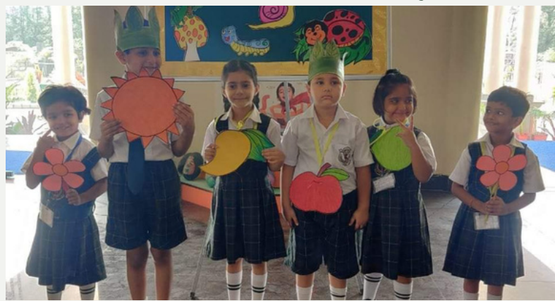
ENGLISH POEM RECITATION