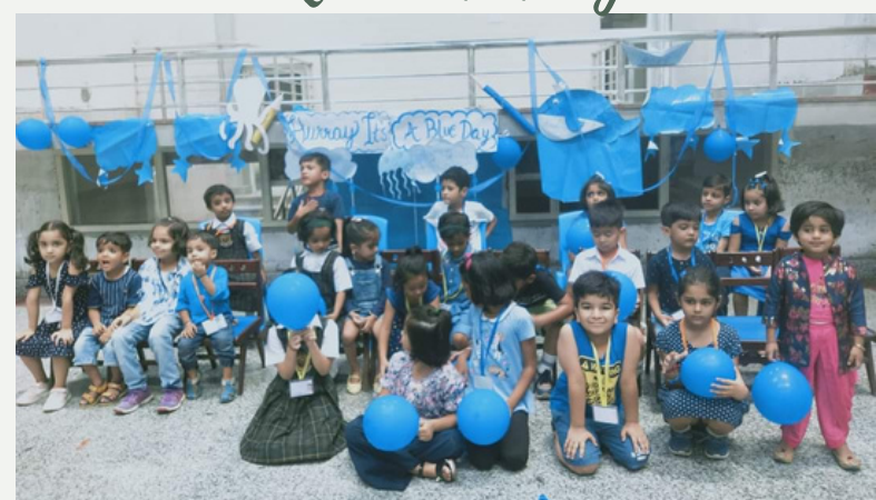
BLUE COLOUR DAY